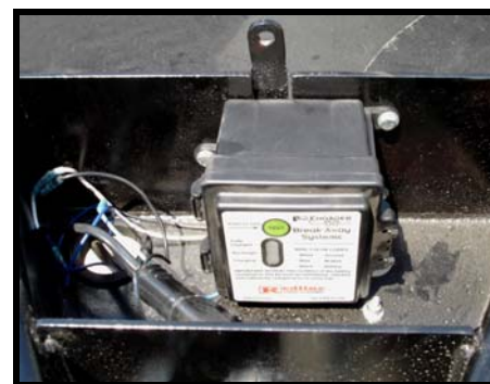
Break-Away Safety System with battery, test light, pull cable and snap hook. Self charging.