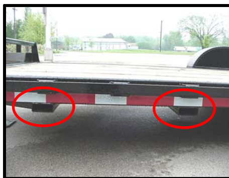
Pallet Fork Holders on both sides of trailer to slide skid loader pallet forks into.