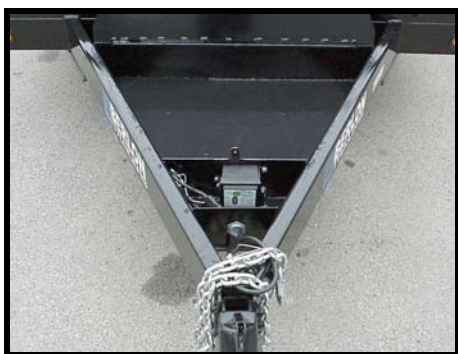
Heavy Duty Lockable Toolbox/ Chain Box in the tongue of the trailer.